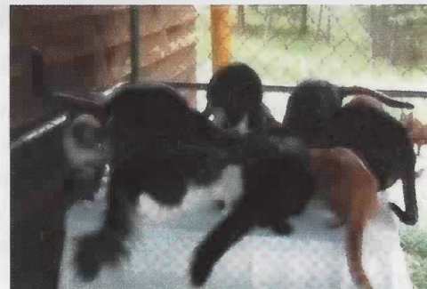
Cats feeding in outdoor play area

Our adoption rate has been around 70% per year. Many of these cats have great personalities and are in need of a permanent loving home. We also have cats that would make great working barn/ranch cats. Our group provides cats to responsible and caring homes and ranches. And while these cats are provided free of charge, we seek donations to help continue our work.